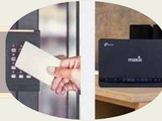
Access Card , WIFI Service